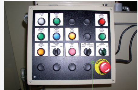
Easy Operator Controls

To see how BMG Forming Solutions can help your business, reach out today.