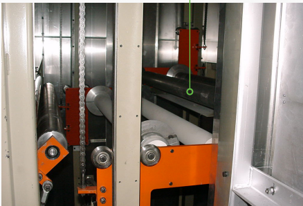
Variable Speed Rollers